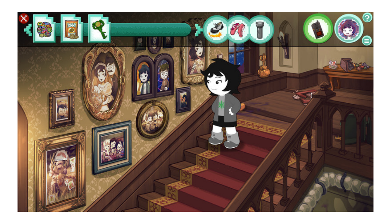
Flix And Chill 2: Millennials Torrent Download [License]

Download >>> <a href="http://bit.ly/2SOjF78">http://bit.ly/2SOjF78</a>