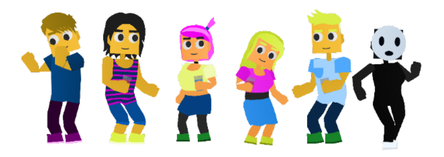
Flix and Chill 2: Millennials will be your guide in this constantly changing and sometimes exhausting social climate we find ourselves in. You'll learn how to:

If so, then you should try "Flix and Chill The Game 2: Millennials!" A game for the artsy fartsiest generation around!!